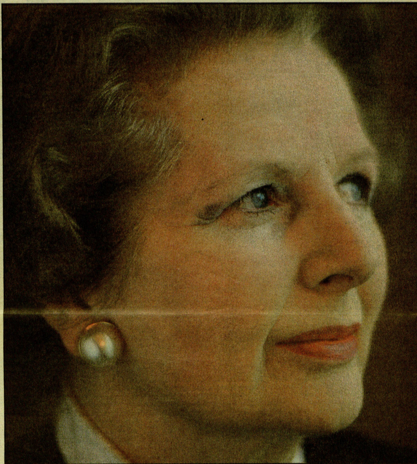
TOMORROW'S DREAM: Mrs Thatcher foresees enterprise and hard work bringing prosperity